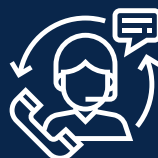
PRIVATE HEALTHCARE SCHEME