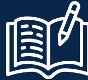
FEE REMISSION FOR TEACHING STAFF