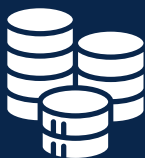
COMPETITIVE SALARIES & PENSION SCHEMES

Bedford is a dynamic and rewarding place to work with a strong sense of community.