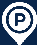
FREE ONSITE PARKING