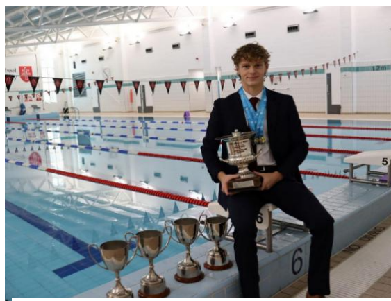
Our Senior Swim Academy Captain winning five events at the East Regional Championships