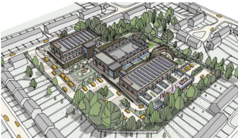
Artist impression of secondary and sixth form campus