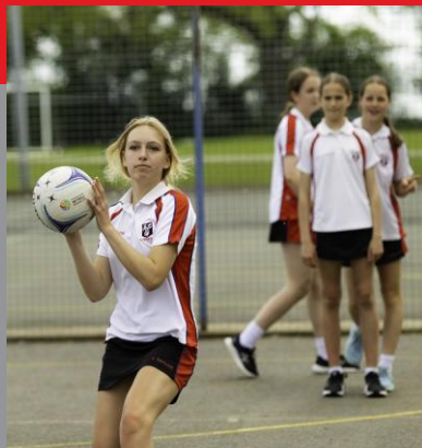
Annual Celebration of Sport Award