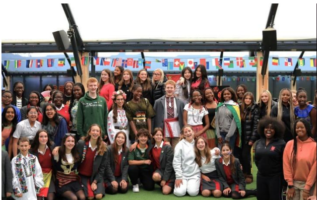
Annual Culture Day