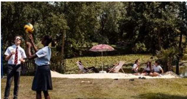
New Hall Beach