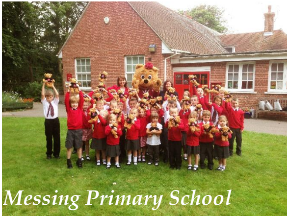
Messing Primary School

In 2012, the School established the New Hall Multi Academy Trust (NHMAT) and became sponsor of nearby Messing Primary School – an Ofsted-rated ‘Good’ school. It is now looking ahead to new ventures and exciting opportunities to further grow its partnership work.