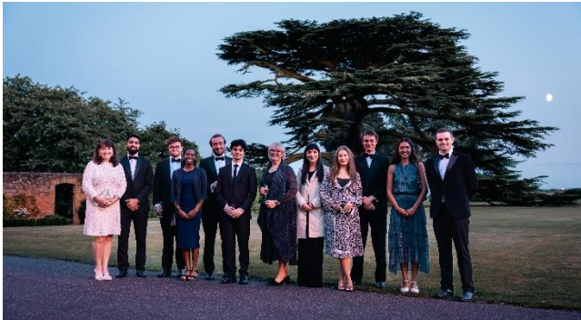
Annual Oxbridge Dinner