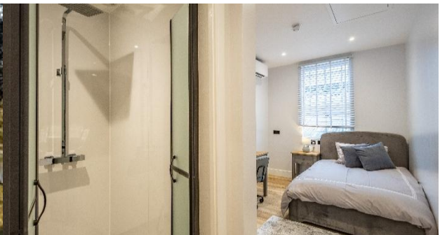
Campion House En-Suite Rooms