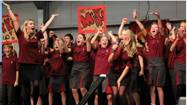
Foundation Day Singing Competition