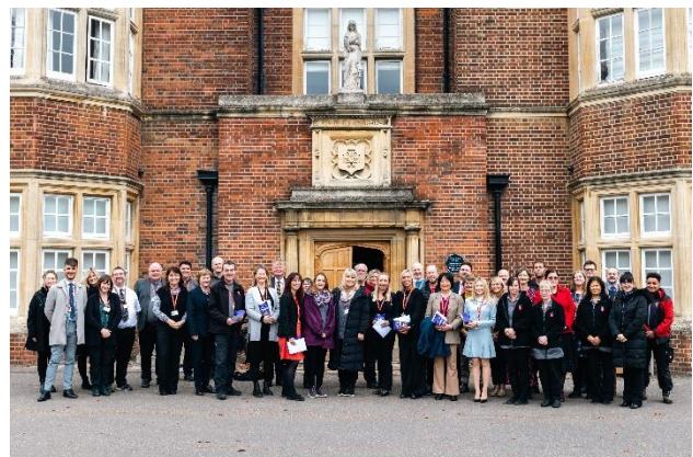
Staff celebrating working at New Hall for over 10 years in 2024

Scan the QR code to listen to staff views on working at New Hall