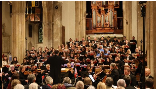
Beaulieu Park Singers | Community Choir