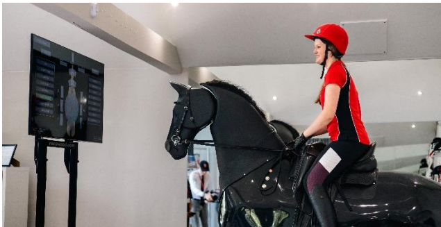
Two Racewood Equestrian Simulators