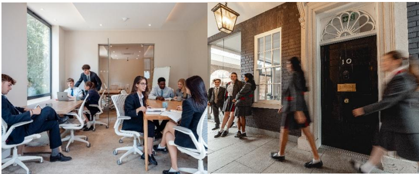
International Business & Languages Centre (IBLC)

In addition to the former Tudor Palace of Beaulieu, 2025 marked the acquisition of New Hall's second Grade I listed building, Boreham House. Plans include our Preparatory Divisions moving to Boreham House, one mile from the New Hall campus.