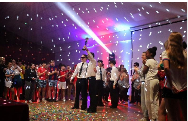
New Hall Come Dancing Charity Competition