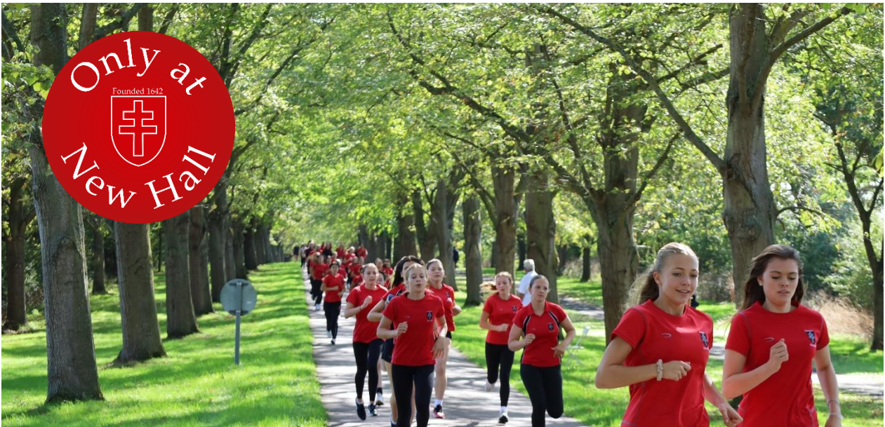
Annual Avenue Run down our historic tree-lined drive, part of our Grade II listed Park and Gardens