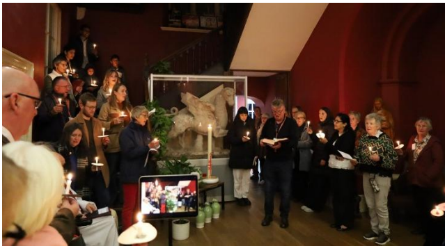
Easter at New Hall