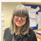
Teacher of Religious Studies and Junior Housemistress Joined in 2016

“I feel valued at Bancroft's, and I appreciate that there does not seem to be a strong sense of hierarchy, rather the pursuit of shared goals across the staff and student body.”