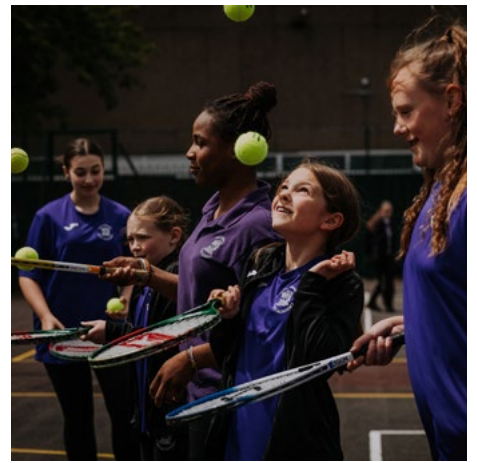
E-ACT Willenhall Academy