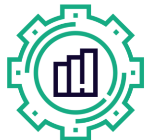
Performance Management Process