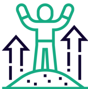
Professional Development Opportunities

We offer regular training and access to a range of internal and external programmes tailored to your learning throughout your career, including NPQs and other professionally accredited qualifications. There are opportunities for career progression with your home school or in other schools across the Trust as well as opportunities to move from our support team to a teaching role.