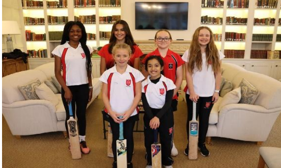
New Hall Girls' Cricketers selected for Essex County Cricket Squads

We have four cricket squares, outdoor and indoor nets, and strong uptake across boys' and girls' cricket in Senior and Preparatory Divisions. Across Years 5 and 6, for example, more than 40 students train each week. A number of our students play at county level and within the player pathways for Essex County Cricket. One of our Sixth Form students is a member of the Scotland Under 19 World Cup Qualifiers Squad.