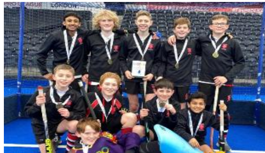
U13 Boys: ISA National Champions 2022