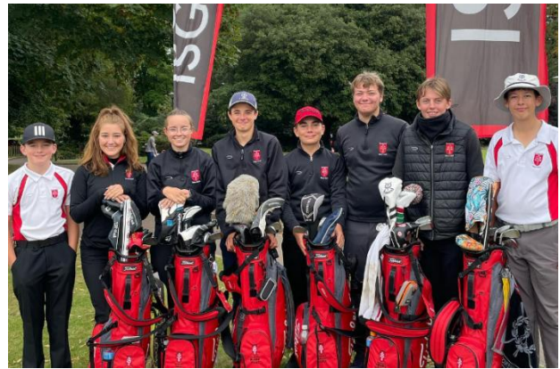
Members of our Golf team competing at the Independent Schools' Golf Association (ISGA) National Championships