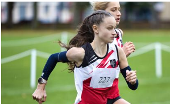
Schools Biathlon 2023

We have high uptake in girls' and boys' Athletics track and field, Cross-Country and Running Clubs, and have achieved great success in district, county and regional competitions, as well as National Finals. In the Michaelmas Term 2022, we won the Eastern Cross-Country Championships, and our Junior Girls Cross-Country team came 2 nd in the English Schools Athletics Association Finals.