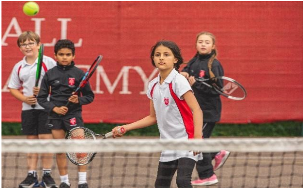
Our students benefit from individual and team coaching in the Preparatory and Senior Divisions (above) New Hall came 2 nd at the National Schools' U18 Girls' Championships (right)

We have an established Tennis programme, and, among the many notable team and individual achievements, our students have won county titles and have represented England. In 2022, members of our New Hall Tennis Team won the Ladies Junior Doubles J3 Saint Cyprien in France, the Fred Perry Championship Finals U16 Boys competition, and the Woodford Wells Open Grade 3 U16 Ladies Singles. Our New School Tennis Team plays regular fixtures as well as the junior event 'Road to Wimbledon', and our senior players have reached Wimbledon qualifiers. In 2022, our Senior Girls' team was the runner-up at the National Schools' U18 Girls' Championships.