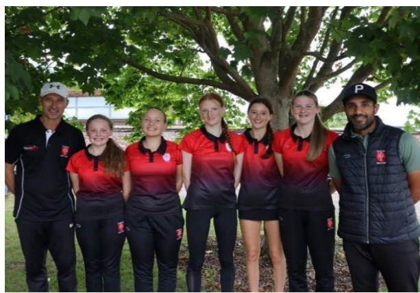
Nasser Hussain and Ravi Bopara with members of our Senior Girls' Cricket Squads

We have an enviable record of success in both individual and team sports, and many of our students compete at county, regional and national levels. In the last year alone, New Hall students have represented Great Britain in Skiing, represented Scotland in Cricket, reached national finals in Swimming (including a Bronze medal win), won internationally-ranked Tennis tournaments, and were crowned national champions in Golf and in Hockey. Several of our recent alumni (New Hallians) have played regularly in the Rugby Premiership, including for Saracens, Worcester Warriors and Leicester Tigers and in the United Rugby Championship for Munster. Several of our rugby players have represented England at School Boy and U20 levels. A New Hallian athlete represented England in the Commonwealth Games in Heptathlon.