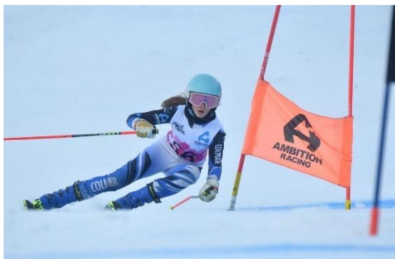
One of our New Hall skiers has been selected to represent Great Britain at the International Children's Races, 2023

New Hall Skiing Team is among the most successful skiing teams in the country. Under the guidance of our Head of Skiing and coaches from an external ski company, we regularly train at Brentwood Dry Ski Slope and compete in the UK and internationally. Our team has achieved outstanding success, winning a great number of team and individual events at the ISA Indoor Championships, at British Interschools Championships, BSA Championships and the ESSKIA British Finals. Our students have been selected to represent Team GB; additionally, in 2023, two of our students will be competing at the highly prestigious World Schools Ski Championships in Turkey.