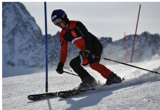
Our students have been selected to compete at the World Schools Ski Championships