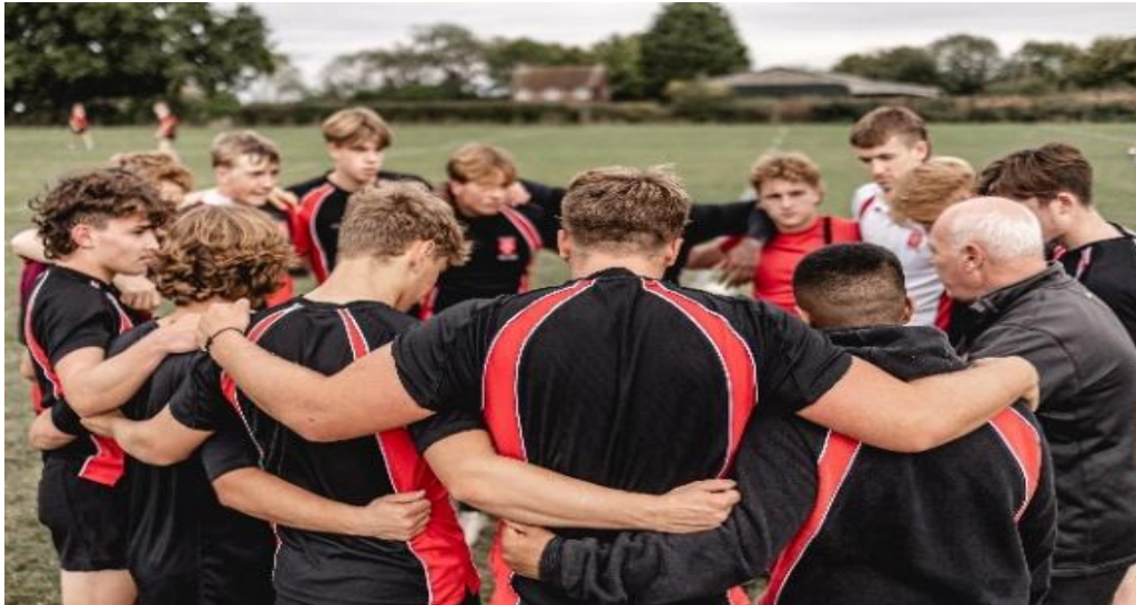
Our 1 st XV benefits from expert training, as well as regular strength and conditioning sessions and video analysis

New Hall has an established reputation in Rugby, and we field up to 25 teams across the age range from Preparatory Division to Senior Divisions in contact rugby in the Michaelmas Term. There are opportunities for girls to learn to play rugby. We also offer inter-house non-contact rugby. In the Lent Term, we field six teams in Rugby Sevens and enter major tournaments, including the Rosslyn Park Sevens. Within our Rugby Programme, we have regular strength and conditioning sessions for our elite teams, and we use video analysis. A number of our students play rugby at county level, and several New Hallians have gone on to play professionally, for teams such as Saracens, Munster, Worcester Warriors and Leicester Tigers, and have represented England School Boy and England U20 level.