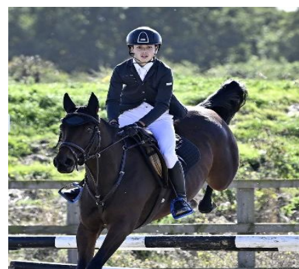
Our Equestrian Team represents the School in National Schools Equestrian Association (NSEA) competitions