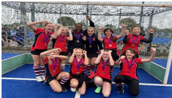
U13 Girls: Essex Champions 2022

We have two floodlit all-weather hockey pitches and successful hockey teams in the Preparatory and Senior Divisions. In 2022, we secured impressive victories in the England Cup Competition, our U13 Girls A Team was crowned Essex Champions, and our U13 Boys A Team won the ISA U13 National Championship.