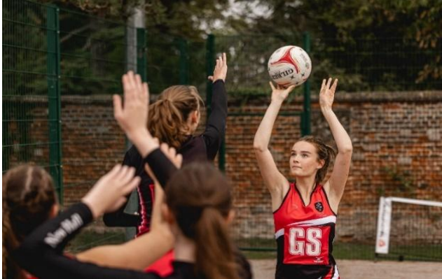
Our students enjoy outstanding training and facilities

Netball is played in both the Preparatory and Senior Divisions, and we have been successful in the Independent Schools National Cup. Our students have gained places in County Academies and National Superleague Franchise Pathways for the 2022-2023 season, following several rounds of competitive trials. We have several students in Essex County Academy, U18 Saracens Mavericks Futures Hub, and London Pulse Hub across a number of age groups.