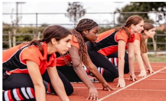
Our Track Teams compete in county, regional and national competitions