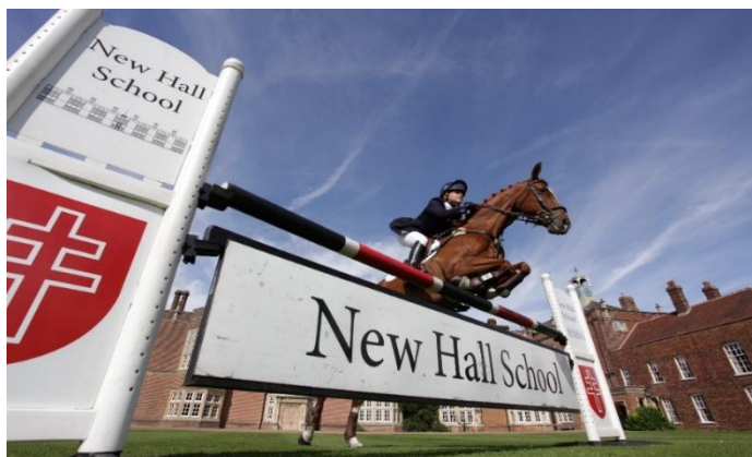
In 2023, New Hall is opening a Learn-to-Ride Centre on the New Hall site, as well as an Equestrian Centre at New Hall Park

New Hall School has a rich history in equestrian sports and, in 2022, our riders qualified for Nationals in the 80-85cm Show Jumping and competed in the National and Plate Championships at Keysoe, achieving 1 st and 4 th in Arena Eventing. The School has links with Chelmsford Equestrian Centre. New Hall has opened a Learn-to-Ride Centre on the New Hall site, and the plan is to open an Equestrian Centre at New Hall Park Farm (2.9 miles from New Hall). We have also recently added two state of the art Equestrian Simulators to our outstanding facilities. These will allow our elite riders to hone their skills, as well as helping beginners and those with disabilities to experience riding. New Hallians have represented Great Britain in a variety of disciplines, in particular Eventing.