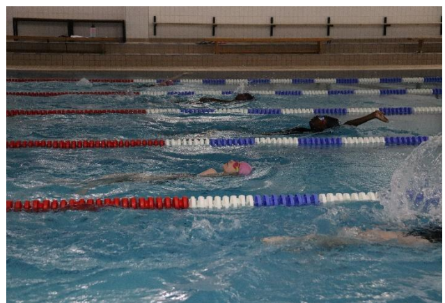
Swimmers in the School's indoor pool