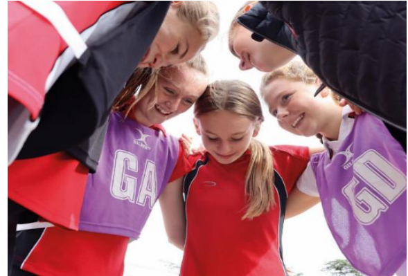
Teamwork is a key element in our success