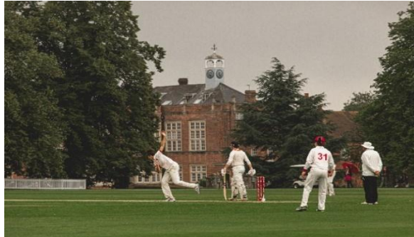
1 st XI Cricket Match at Six Acres in New Hall