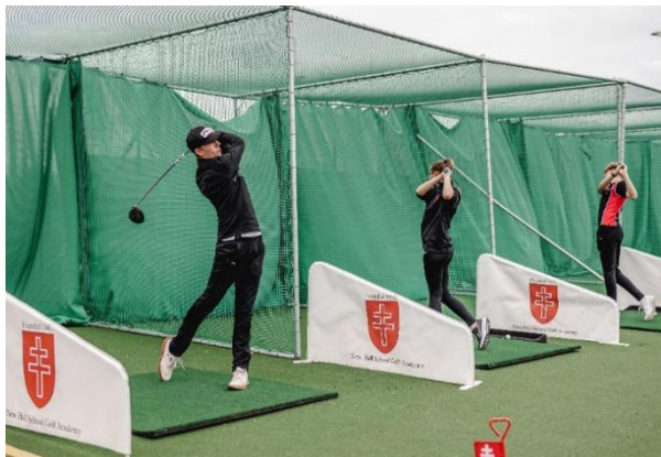
Our students benefit from 12 on-site golf nets and launch monitor, and regular access to a local driving range and golf course

New Hall School has developed an outstanding reputation in golf, and now has more than 100 students training regularly. Our students have secured victories against some of the country's elite players at U16 and U18 level, and we regularly compete at major competitions such as the Independent Schools Golf Association, British Schools and HMC competitions, as well as the Alexander Quinn Invitational. We have a number of students playing at county level, as well as England Girls' Regional Squads and England Boys' U18 Squad. In 2023, members of our team will be competing at the Golf World Junior Championships.