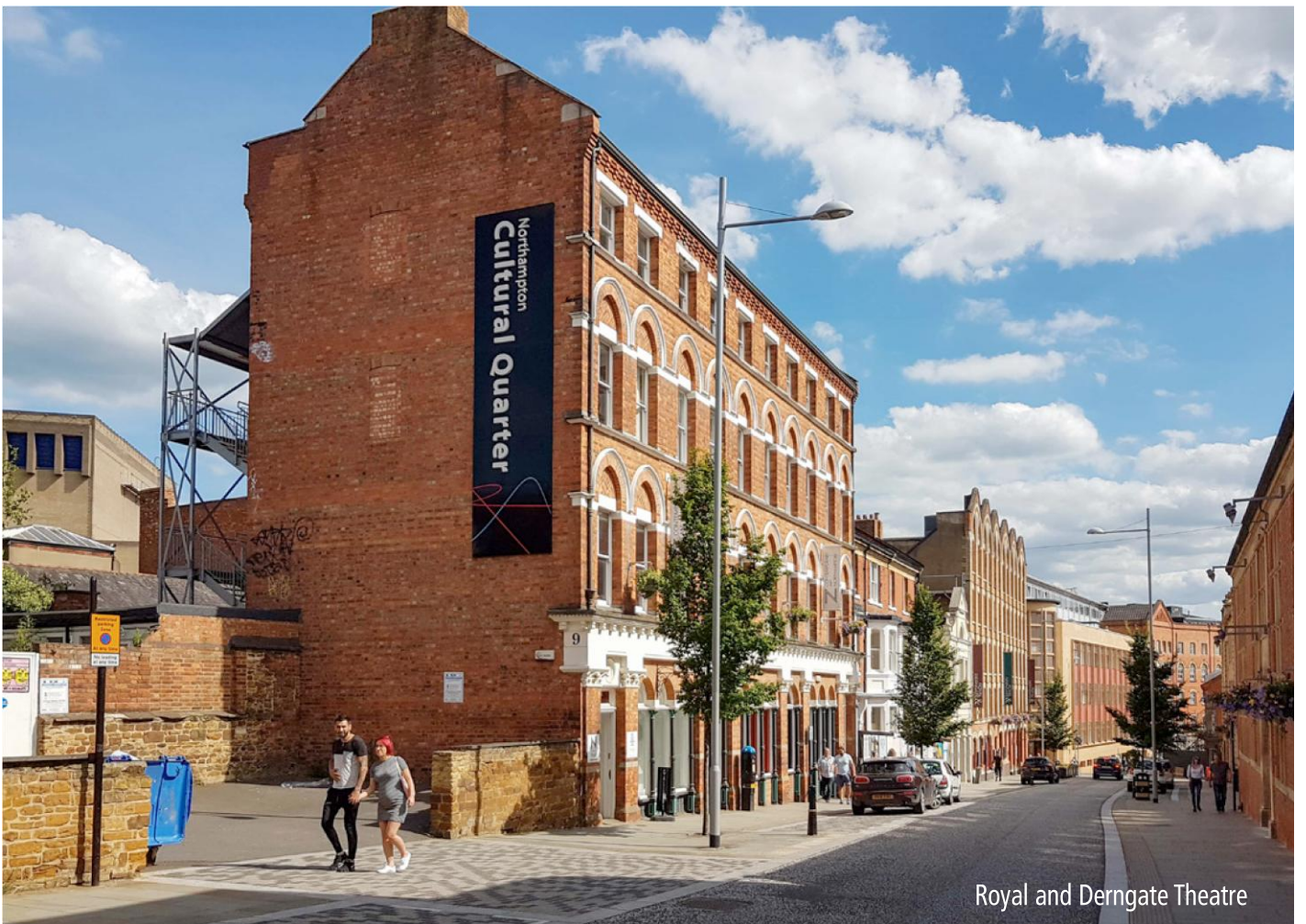
Royal and Derngate Theatre