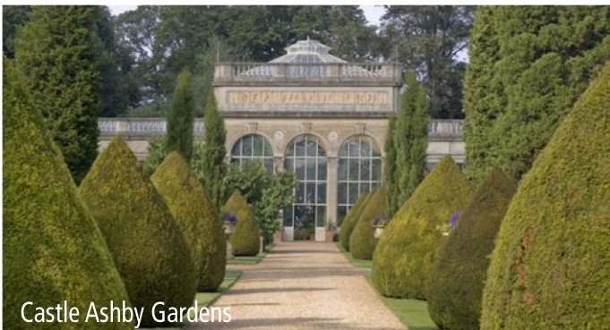
Castle Ashby Gardens