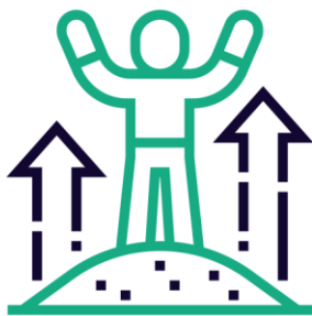
Professional Development Opportunities

We offer regular training and access to a range of internal and external programmes tailored to your learning throughout your career, including NPQs and other professionally accredited qualifications. There are opportunities for career progression with your home school or in other schools across the Trust as well as opportunities to move from our support team to a teaching role.