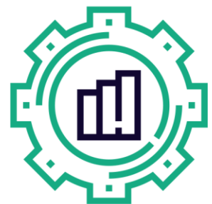
Performance Management Process