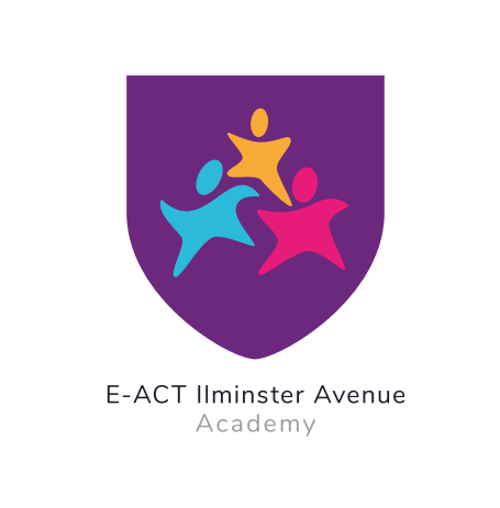
E-ACT Ilminster Avenue Academy