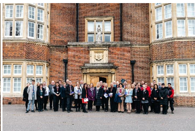
Staff celebrating working at New Hall for over 10 years in 2024