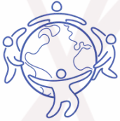
CHILDERIC PRIMARY SCHOOL