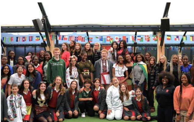
Annual Culture Day