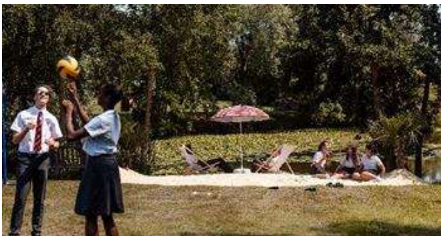
New Hall Beach