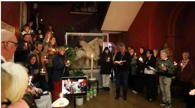
Easter at New Hall