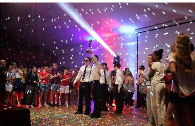
New Hall Come Dancing Charity Competition