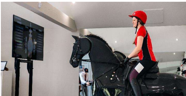
Two Racewood Equestrian Simulators