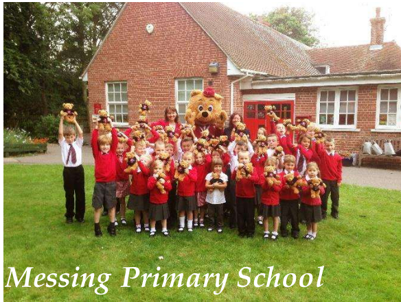
Messing Primary School

In 2012, the School established the New Hall Multi Academy Trust (NHMAT) and became sponsor of nearby Messing Primary School – an Ofsted-rated ‘Good’ school. It is now looking ahead to new ventures and exciting opportunities to further grow its partnership work.