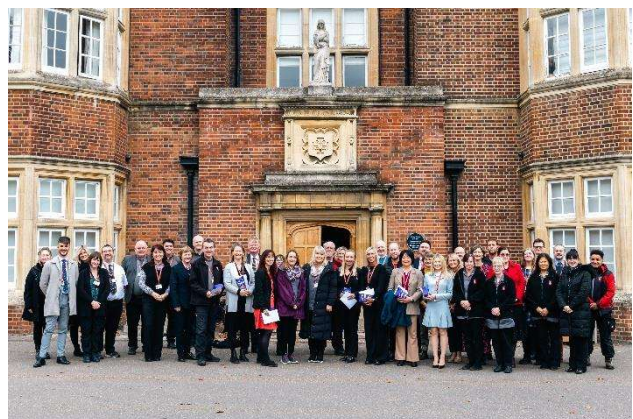
Staff celebrating working at New Hall for over 10 years in 2024

Scan the QR code to listen to staff views on working at New Hall