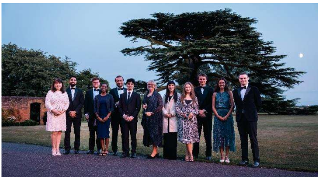
Annual Oxbridge Dinner