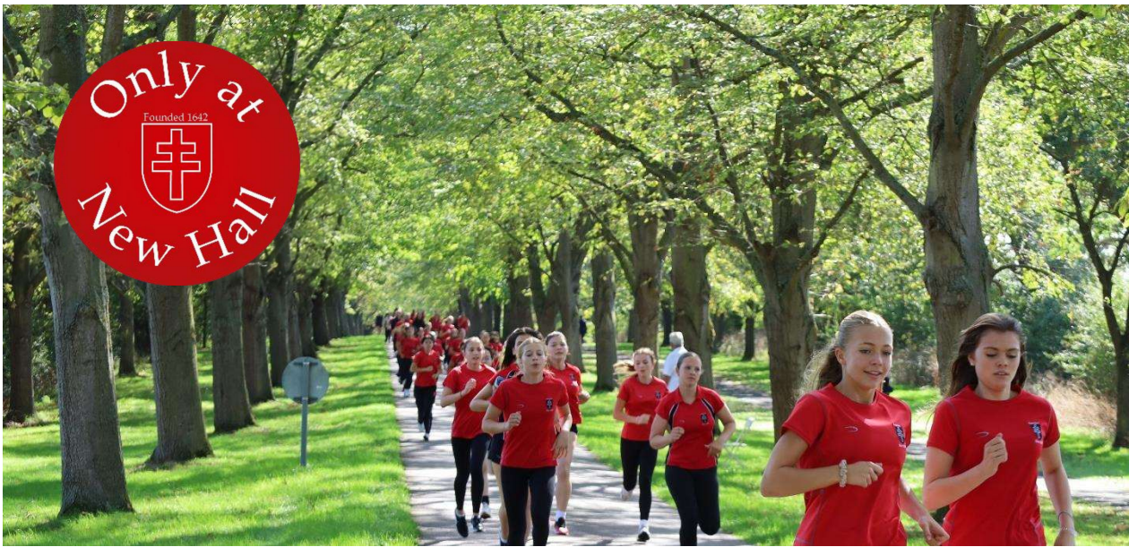
Annual Avenue Run down our historic tree-lined drive, part of our Grade II listed Park and Gardens