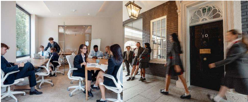
International Business & Languages Centre (IBLC)

In addition to the former Tudor Palace of Beaulieu, 2025 marked the acquisition of New Hall's second Grade I listed building, Boreham House. Plans include our Preparatory Divisions moving to Boreham House, one mile from the New Hall campus.