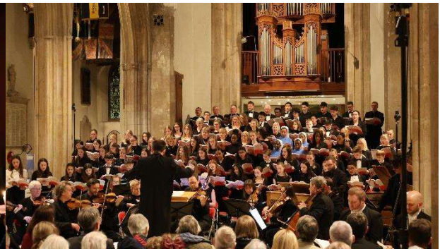
Beaulieu Park Singers | Community Choir