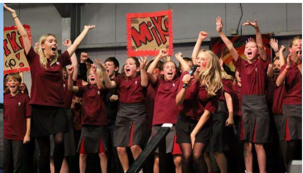
Foundation Day Singing Competition