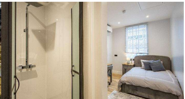
Campion House En-Suite Rooms