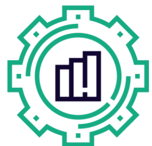
Performance Management Process