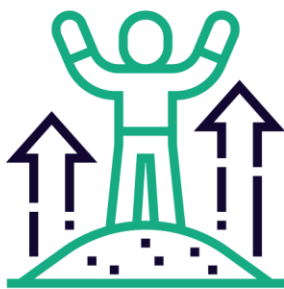
Professional Development Opportunities

We offer regular training and access to a range of internal and external programmes tailored to your learning throughout your career, including NPQs and other professionally accredited qualifications. There are opportunities for career progression with your home school or in other schools across the Trust as well as opportunities to move from our support team to a teaching role.