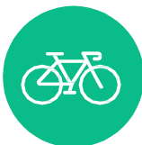
Bike 2 work scheme