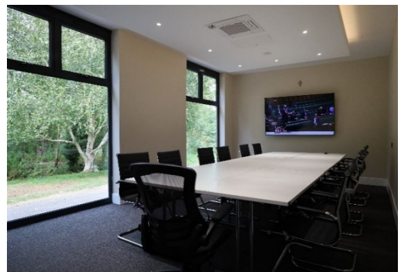
The Business boardroom classroom