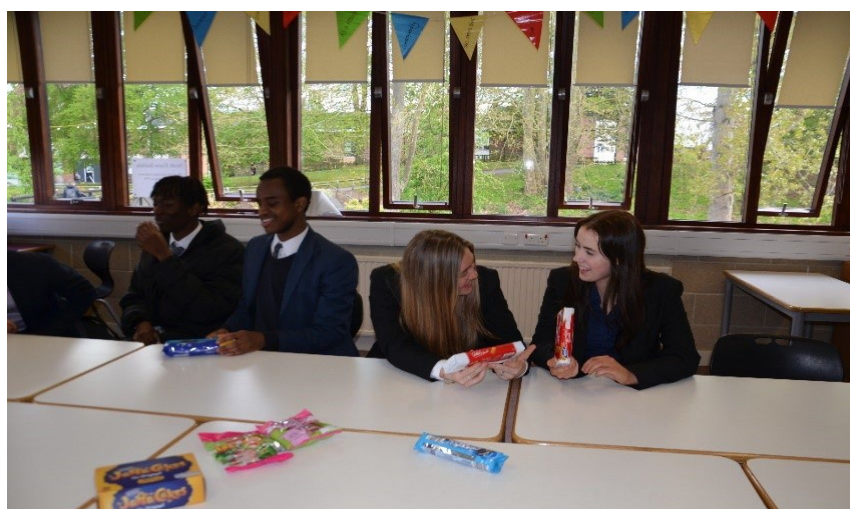
Members of Business Society evaluating the use of 'Me too marketing'

With a focus on introducing the students to real-life examples of the business world, the co-curriculum enhances our provision of the subject. The weekly Economics and Business Society is well attended by students who are keen to discuss and debate current issues affecting the global economy and businesses. In recent Society meetings, students have discussed behavioural economics, the impacts of tariffs on the global economy and dynamic pricing.