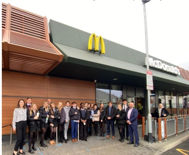
Year 13 visited McDonalds with talks from the Franchisee and the former CFO.