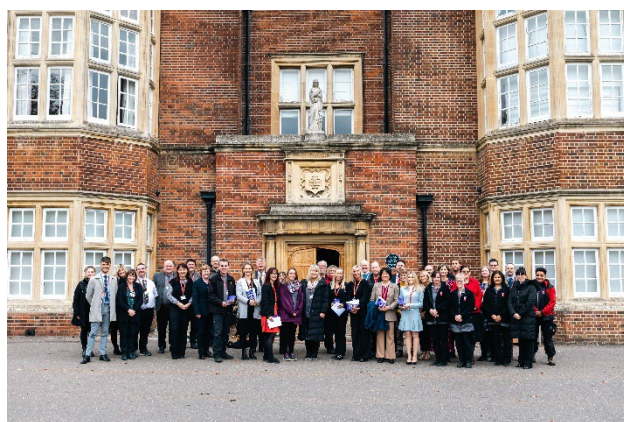
Staff celebrating working at New Hall for over 10 years in 2024