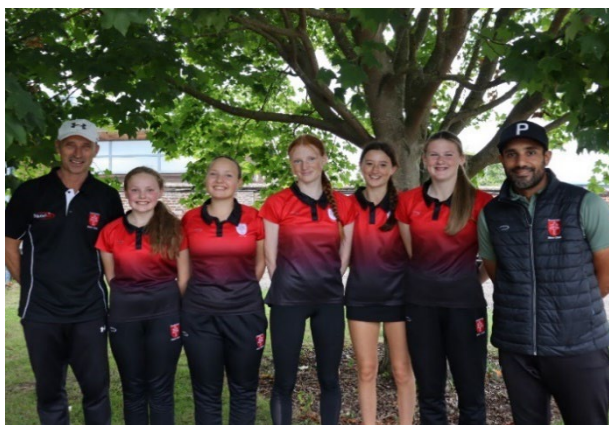
Nasser Hussain and Ravi Bopara with members of our Senior Girls' Cricket Squad

We have an enviable record of success in both individual and team sports, and many of our students compete at county, regional and national levels. In the last year alone, New Hall students have represented Great Britain in Skiing, represented Scotland in Cricket, reached national finals in Swimming (including a Bronze medal win), won internationally-ranked Tennis