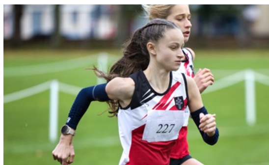
Schools Biathlon 2023

We have high uptake in girls' and boys' Athletics track and field, Cross-Country and Running Clubs, and have achieved great success in district, county and regional competitions, as well as National Finals. In the Michaelmas Term 2022, we won the Eastern Cross-Country Championships, and our Junior Girls Cross-Country team came 2nd in the English Schools Athletics Association Finals.