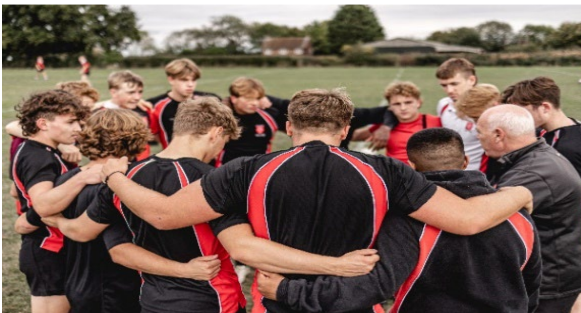
Our 1 st XV benefits from expert training, as well as regular strength and conditioning sessions and video analysis

New Hall has an established reputation in Rugby, and we field up to 25 teams across the age range from Preparatory Division to Senior Divisions in contact rugby in the Michaelmas Term. There are opportunities for girls to learn to play rugby. We also offer inter-house non-contact rugby. In the Lent Term, we field six teams in Rugby Sevens and enter major tournaments, including the Rosslyn Park Sevens. Within our Rugby Programme, we have regular strength and conditioning sessions for our elite teams, and we use video analysis. A number of our students play rugby at county level, and several New Hallians have gone on to play professionally, for teams such as Saracens, Munster, Worcester Warriors and Leicester Tigers, and have represented England School Boy and England U20 level.