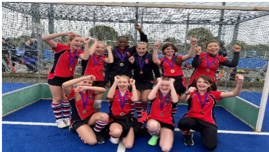
U13 Girls: Essex Champions 2022

We have two floodlit all-weather hockey pitches and successful hockey teams in the Preparatory and Senior Divisions. In 2022, we secured impressive victories in the England Cup Competition, our U13 Girls A Team was crowned Essex Champions, and our U13 Boys A Team won the ISA U13 National Championship.