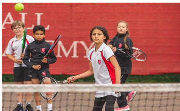
Our students benefit from individual and team coaching in the Preparatory and Senior Divisions (above)

We have an established Tennis programme, and, among the many notable team and individual achievements, our students have won county titles and have represented England. In 2022, members of our New Hall Tennis Team won the Ladies Junior Doubles J3 Saint Cyprien in France, the Fred Perry Championship Finals U16 Boys competition, and the Woodford Wells Open Grade 3 U16 Ladies Singles. Our New School Tennis Team plays regular fixtures as well as the junior event 'Road to Wimbledon', and our senior players have reached Wimbledon qualifiers. In 2022, our Senior Girls' team was the runner-up at the National Schools' U18 Girls' Championships.