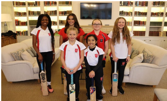
New Hall Girls' Cricketers selected for Essex County Cricket Squads

We have four cricket squares, outdoor and indoor nets, and strong uptake across boys' and girls' cricket in Senior and Preparatory Divisions. Across Years 5 and 6, for example, more than 40 students train each week. A number of our students play at county level and within the player pathways for Essex County Cricket. One of our Sixth Form students is a member of the Scotland Under 19 World Cup Qualifiers Squad.