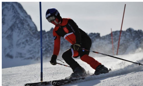
Our students have been selected to compete at the World Schools Ski Championships