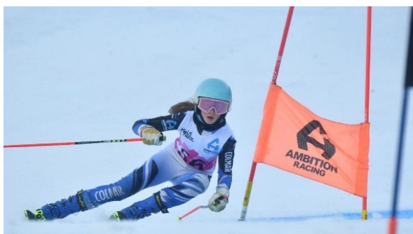
One of our New Hall skiers has been selected to represent Great Britain at the International Children's Races, 2023

Our students have been selected to represent Team GB; additionally, in 2023, two of our students will be competing at the highly prestigious World Schools Ski Championships in Turkey.