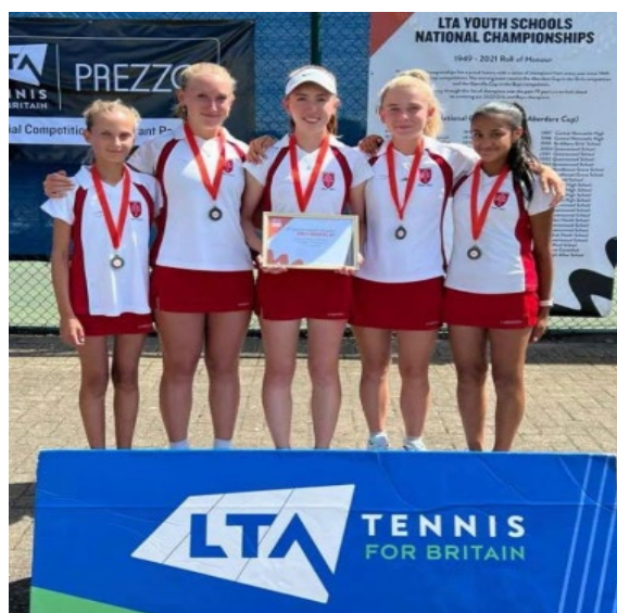
New Hall came 2 nd at the National Schools' U18 Girls' Championships (right)