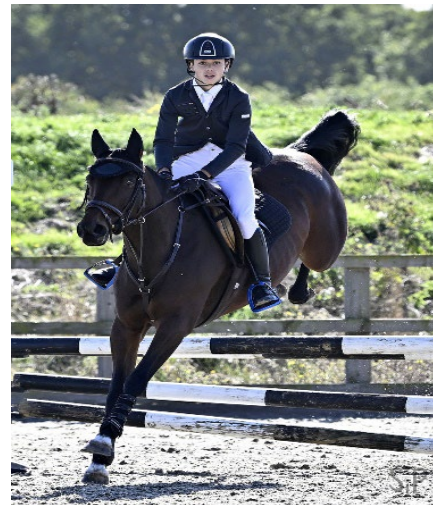
Our Equestrian Team represents the School in National Schools Equestrian Association (NSEA) competitions