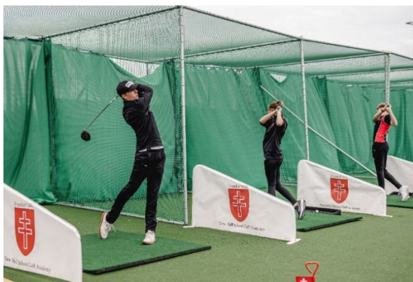
Our students benefit from 12 on-site golf nets and launch monitor, and regular access to a local driving range and golf course

England Girls' Regional Squads and England Boys' U18 Squad. In 2023, members of our team will be competing at the Golf World Junior Championships.