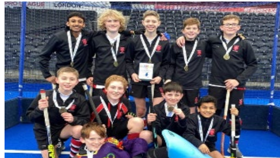
U13 Boys: ISA National Champions 2022