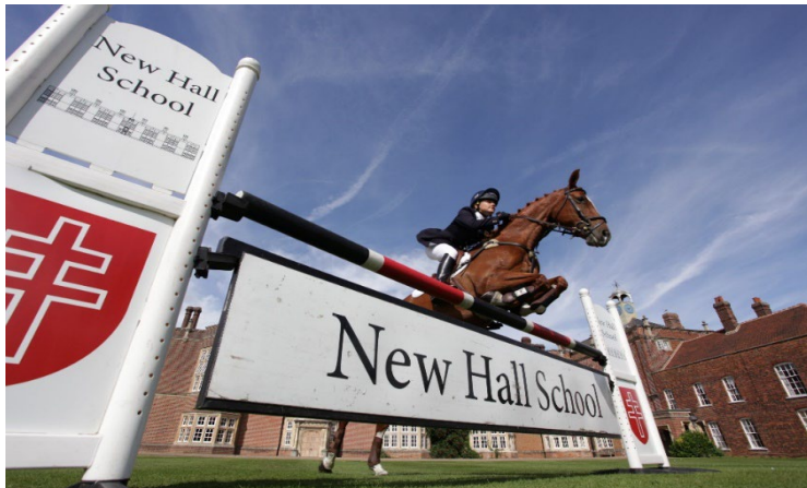
In 2023, New Hall is opening a Learn-to-Ride Centre on the New Hall site, as well as an Equestrian Centre at New Hall Park

New Hall School has a rich history in equestrian sports and, in 2022, our riders qualified for Nationals in the 80-85cm Show Jumping and competed in the National and Plate Championships at Keysoe, achieving 1 st and 4 th in Arena Eventing. The School has links with Chelmsford Equestrian Centre. New Hall has opened a Learn-to-Ride Centre on the New Hall site, and the plan is to open an Equestrian Centre at New Hall Park Farm (2.9 miles from New Hall). We have also recently added two state of the art Equestrian Simulators to our outstanding facilities. These will allow our elite riders to hone their skills, as well as helping beginners and those with disabilities to experience riding. New Hallians have represented Great Britain in a variety of disciplines, in particular Eventing.