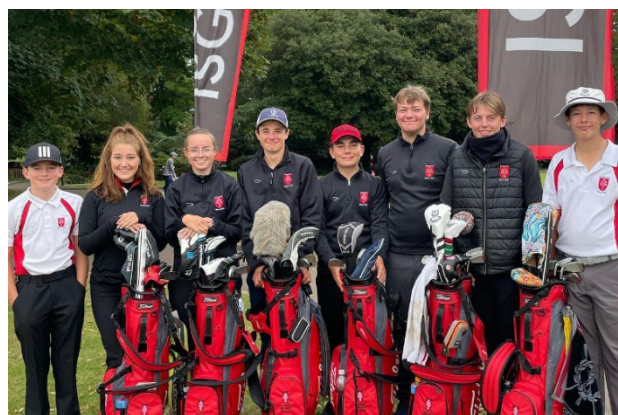
Members of our Golf team competing at the Independent Schools' Golf Association (ISGA) National Championships