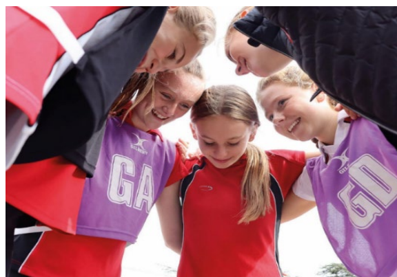
Teamwork is a key element in our success