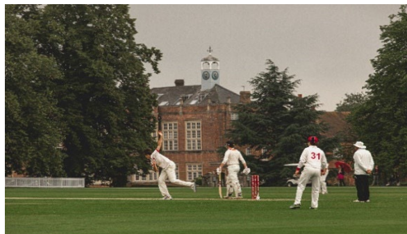
1 st XI Cricket Match at Six Acres in New Hall