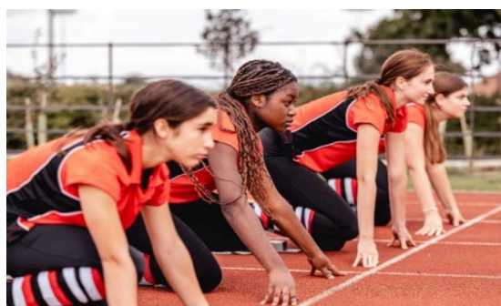
Our Track Teams compete in county, regional and national competitions