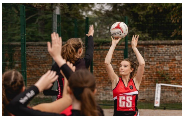
Our students enjoy outstanding training and facilities

Netball is played in both the Preparatory and Senior Divisions, and we have been successful in the Independent Schools National Cup. Our students have gained places in County Academies and National Superleague Franchise Pathways for the 2022-2023 season, following several rounds of competitive trials. We have several students in Essex County Academy, U18 Saracens Mavericks Futures Hub, and London Pulse Hub across a number of age groups.