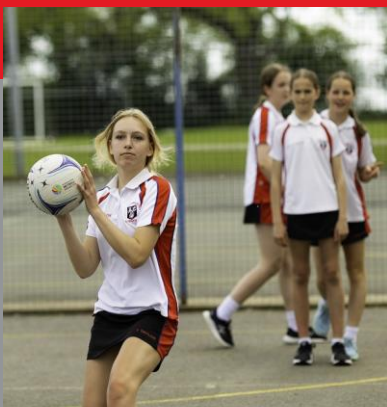
Annual Celebration of Sport Award