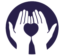
Givers, Not Takers