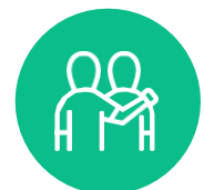
Occupational health support