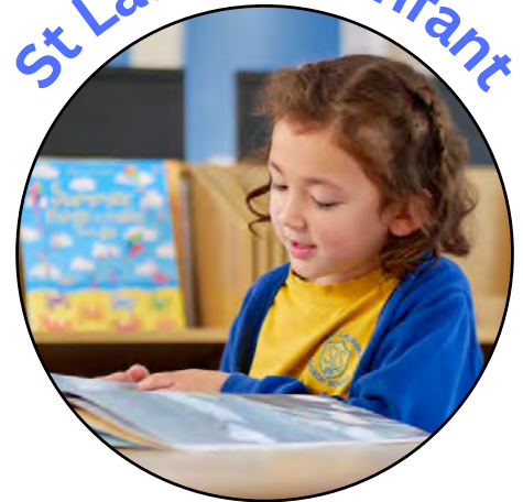
St Laurence Infant