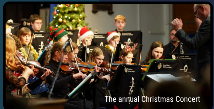
The annual Christmas Concert