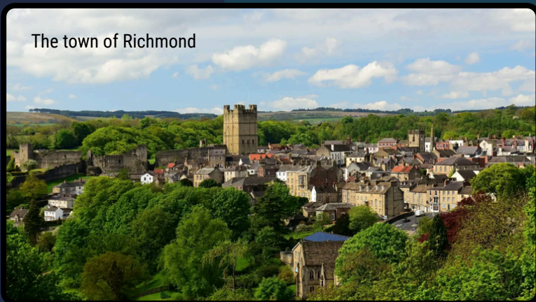
The town of Richmond

Over thirty five primary schools contribute to the School's Year 7 intake. The School has an admission limit of 250.