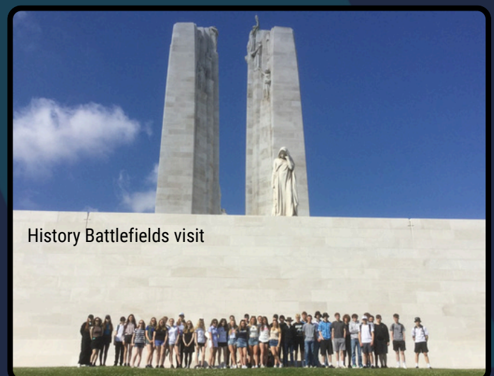
History Battlefields visit

The School places great emphasis on good staff-student relationships and on providing a hard-working, well-disciplined atmosphere in which students can flourish as individuals.