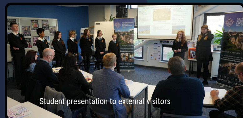
Student presentation to external visitors

Examples include a science trip to Cern, geography field work on the East coast and Year 7 visits to France.