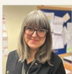
Teacher of Religious Studies and Junior Housemistress Joined in 2016

"I feel valued at Bancroft's, and I appreciate that there does not seem to be a strong sense of hierarchy, rather the pursuit of shared goals across the staff and student body."