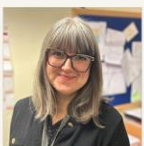
Teacher of Religious Studies and Junior Housemistress Joined in 2016

"I feel valued at Bancroft's, and I appreciate that there does not seem to be a strong sense of hierarchy, rather the pursuit of shared goals across the staff and student body."