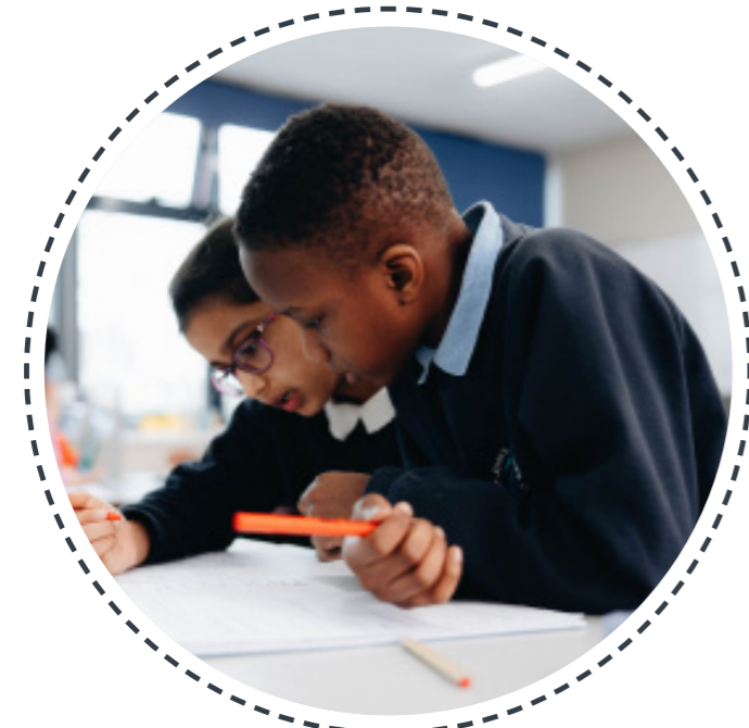
ST JOHN'S & ST PETER'S