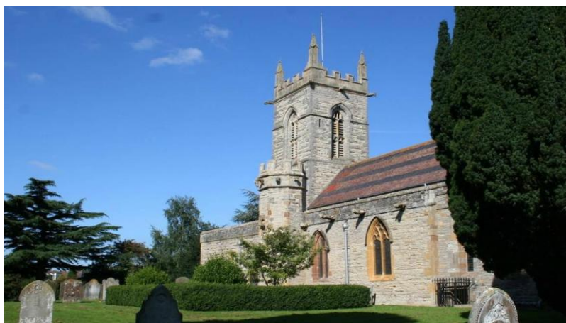
St Matthew's Church

In September 2015, funding from Warwickshire County Council and the Parish Council enabled us to refurbish and restock our library. The Perkins Educational Foundation has also generously supported our Early Years' outdoor area and a field-based trim trail to be installed in the Autumn, 2024. Salford Priors also has an on-site Forest School, a playground and large playing field, providing plenty of space for playtimes and outdoor activities.