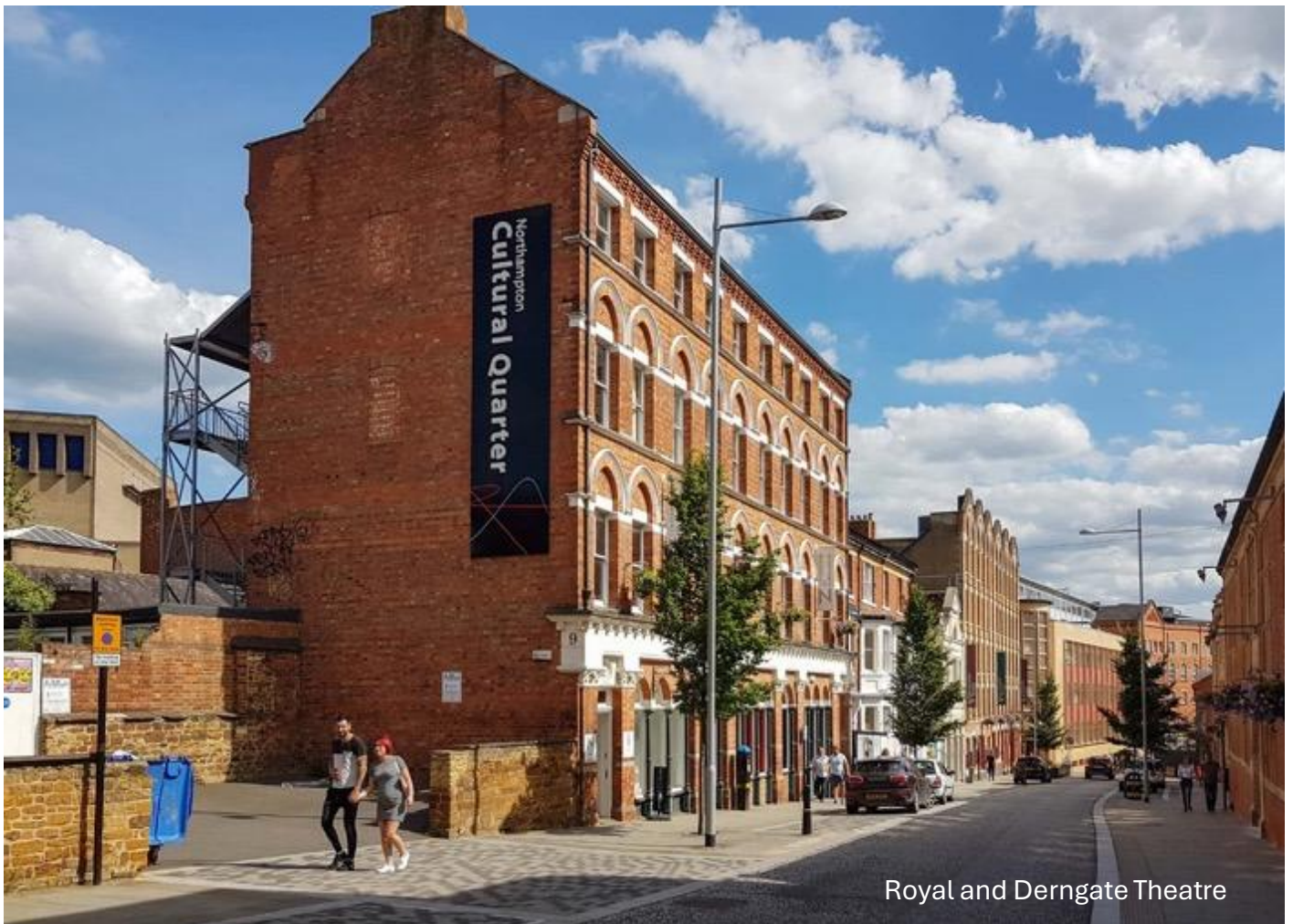
Royal and Derngate Theatre