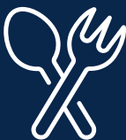
FREE LUNCHES DURING TERMTIME