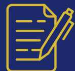
FREE WILL WRITING SERVICE

Staff can work across our family of schools, enabling our academies to benefit from wider expertise and to offer individuals fresh opportunities. Quality of life outside work significantly shapes the way in which people perform, so the need to achieve a healthy work/life balance is an important aspect of our commitment to staff.