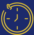
FLEXIBLE AND FAMILY FRIENDLY POLICIES