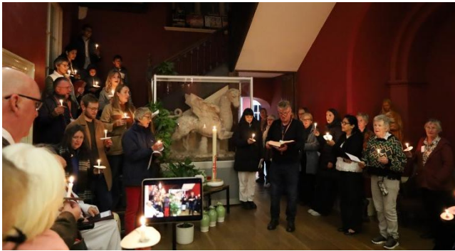
Easter at New Hall