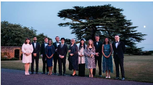
Annual Oxbridge Dinner