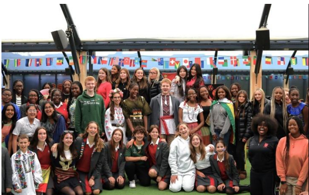
Annual Culture Day