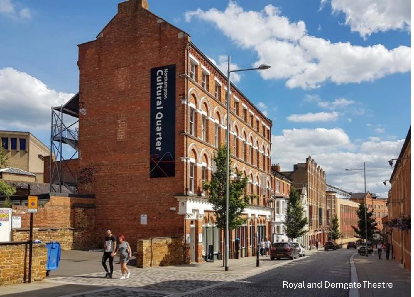
Royal and Derngate Theatre