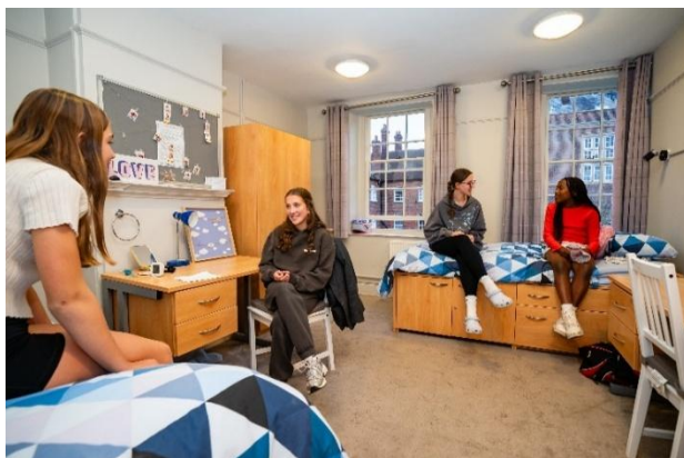
Boarding at New Hall