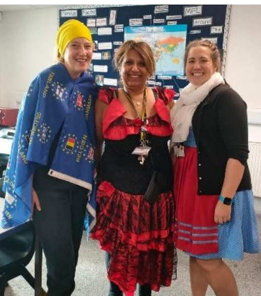
European Day of Languages