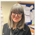
Teacher of Religious Studies and Junior Housemistress Joined in 2016

"I feel valued at Bancroft's, and I appreciate that there does not seem to be a strong sense of hierarchy, rather the pursuit of shared goals across the staff and student body."