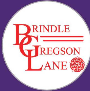
BRINDLE GREGSON LANE PRIMARY