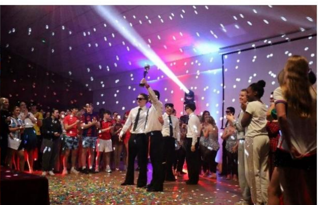
New Hall Come Dancing Charity Competition