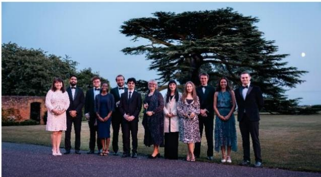
Annual Oxbridge Dinner