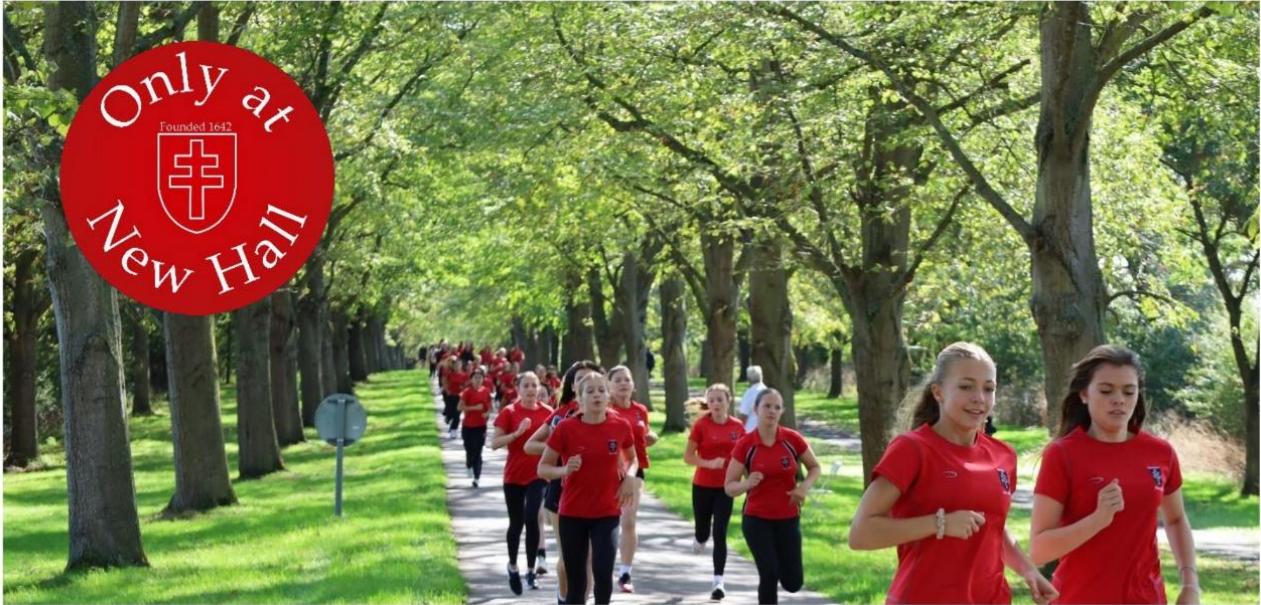
Annual Avenue Run down our historic tree-lined drive, part of our Grade II listed Park and Gardens