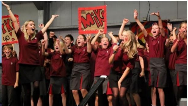
Foundation Day Singing Competition