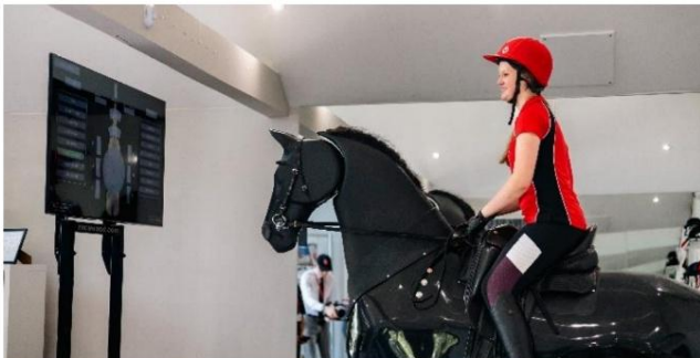
Two Racewood Equestrian Simulators