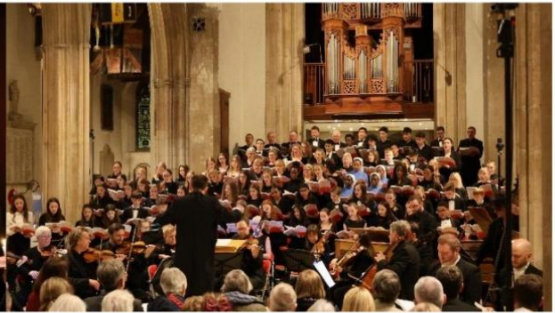
Beaulieu Park Singers | Community Choir