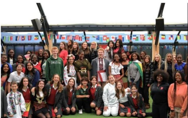
Annual Culture Day