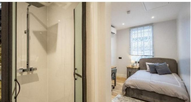
Campion House En-Suite Rooms