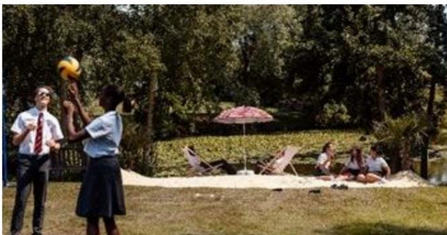
New Hall Beach