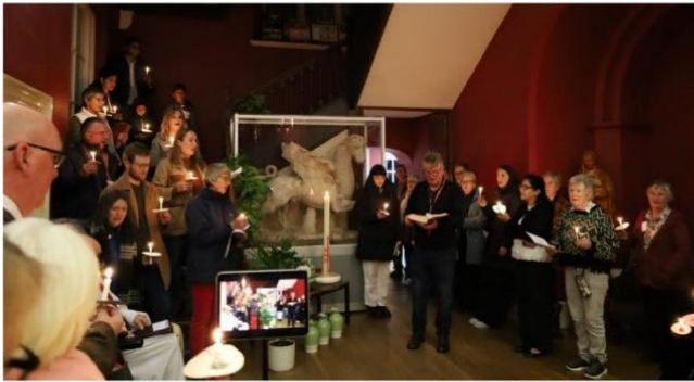
Easter at New Hall