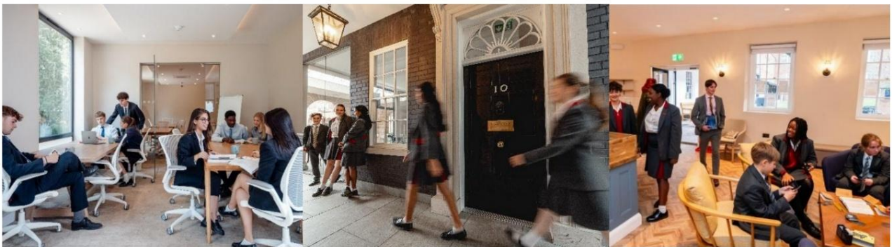
International Business & Languages Centre (IBLC)

In addition to the former Tudor Palace of Beaulieu, 2025 marked the acquisition of New Hall's second Grade I listed building, Boreham House. Plans include our Preparatory Divisions moving to Boreham House, one mile from the New Hall campus.