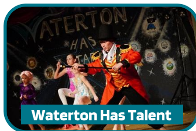
Waterton Has Talent