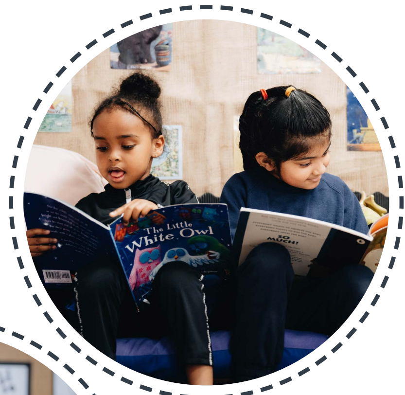
ST JOHN'S & ST PETER'S