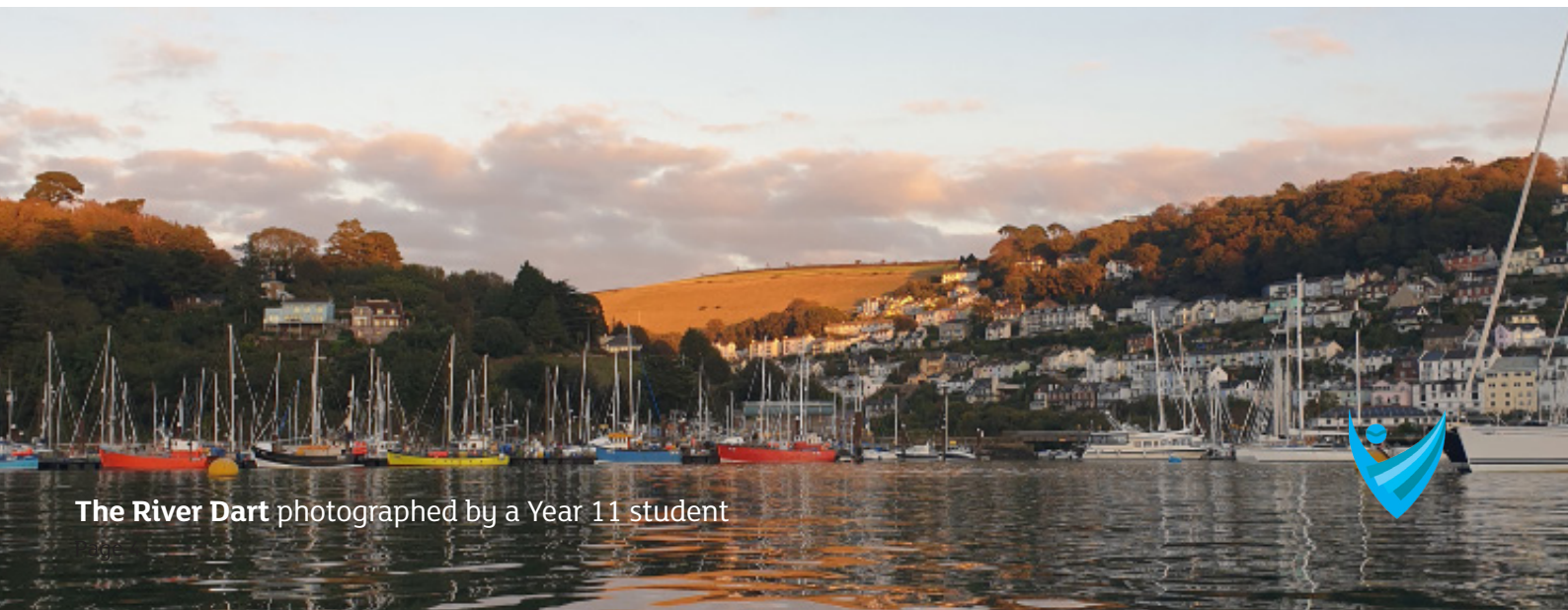
The River Dart photographed by a Year 11 student