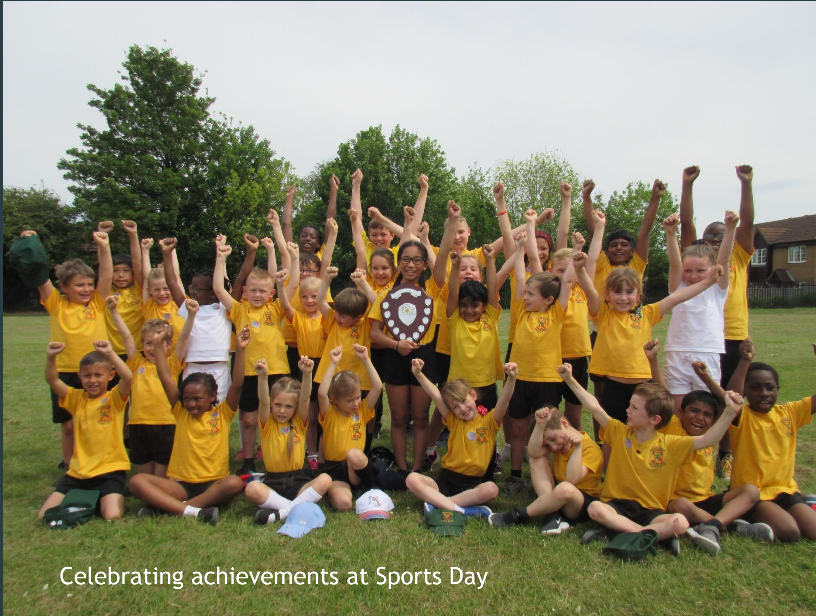
Celebrating achievements at Sports Day