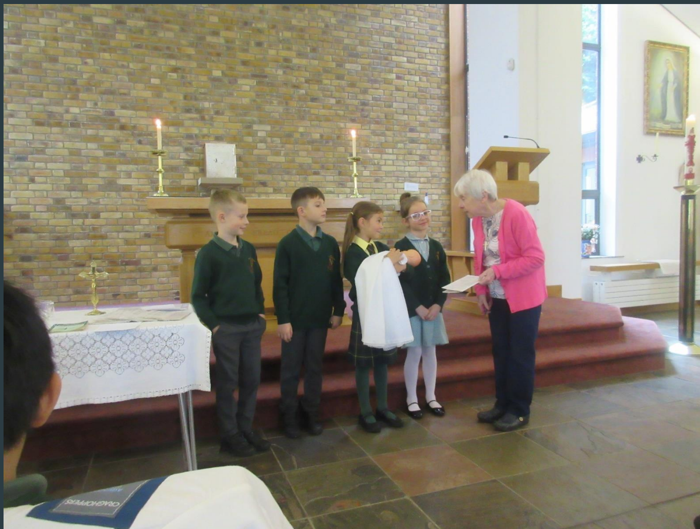
A visit to St Clare's Church to learn about baptism