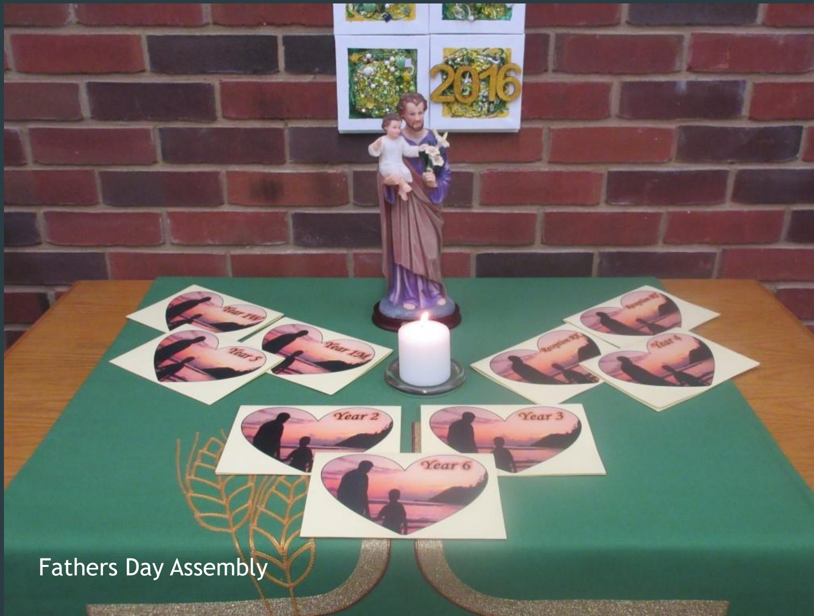
Fathers Day Assembly