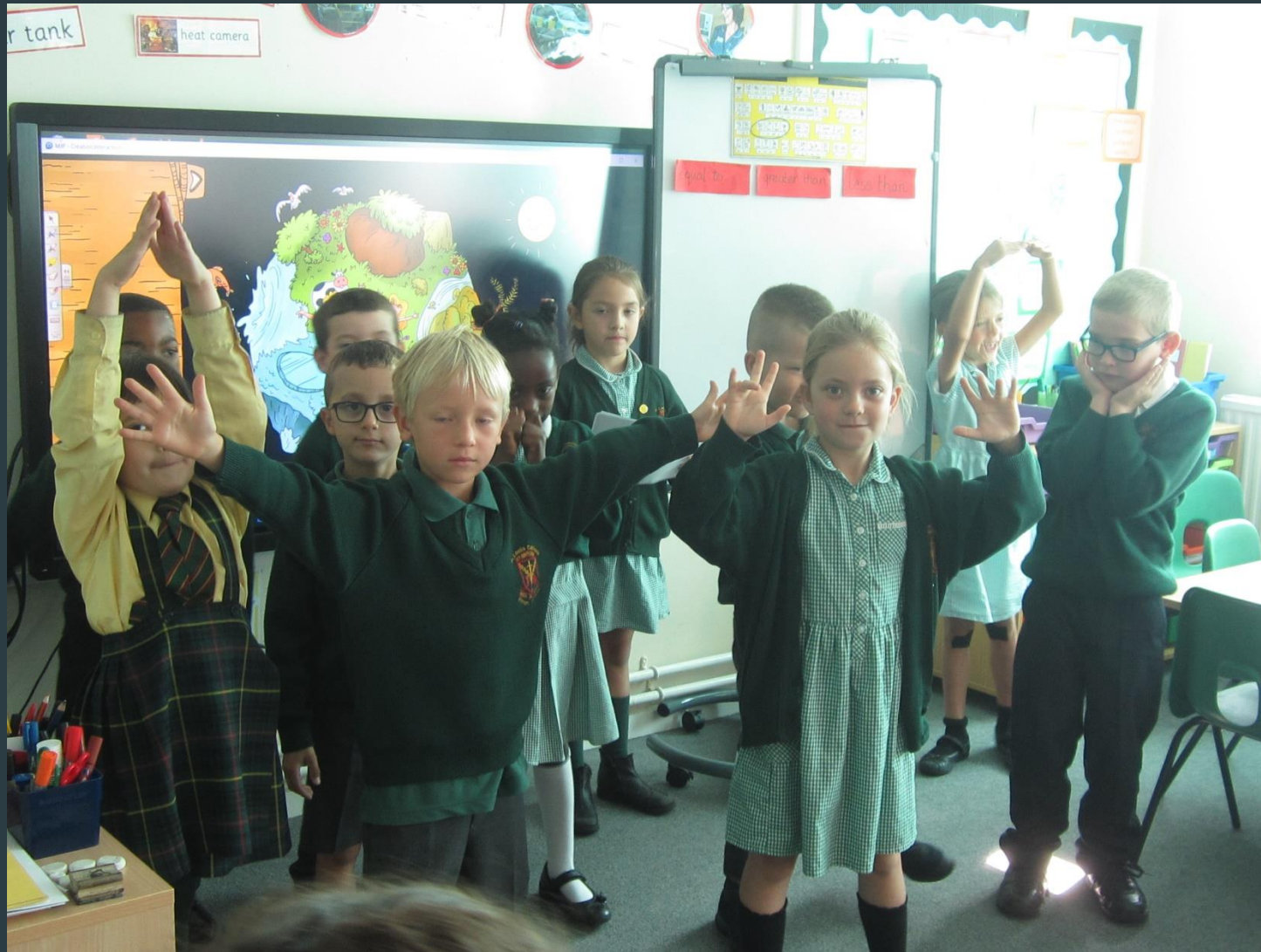
Learning RE through drama