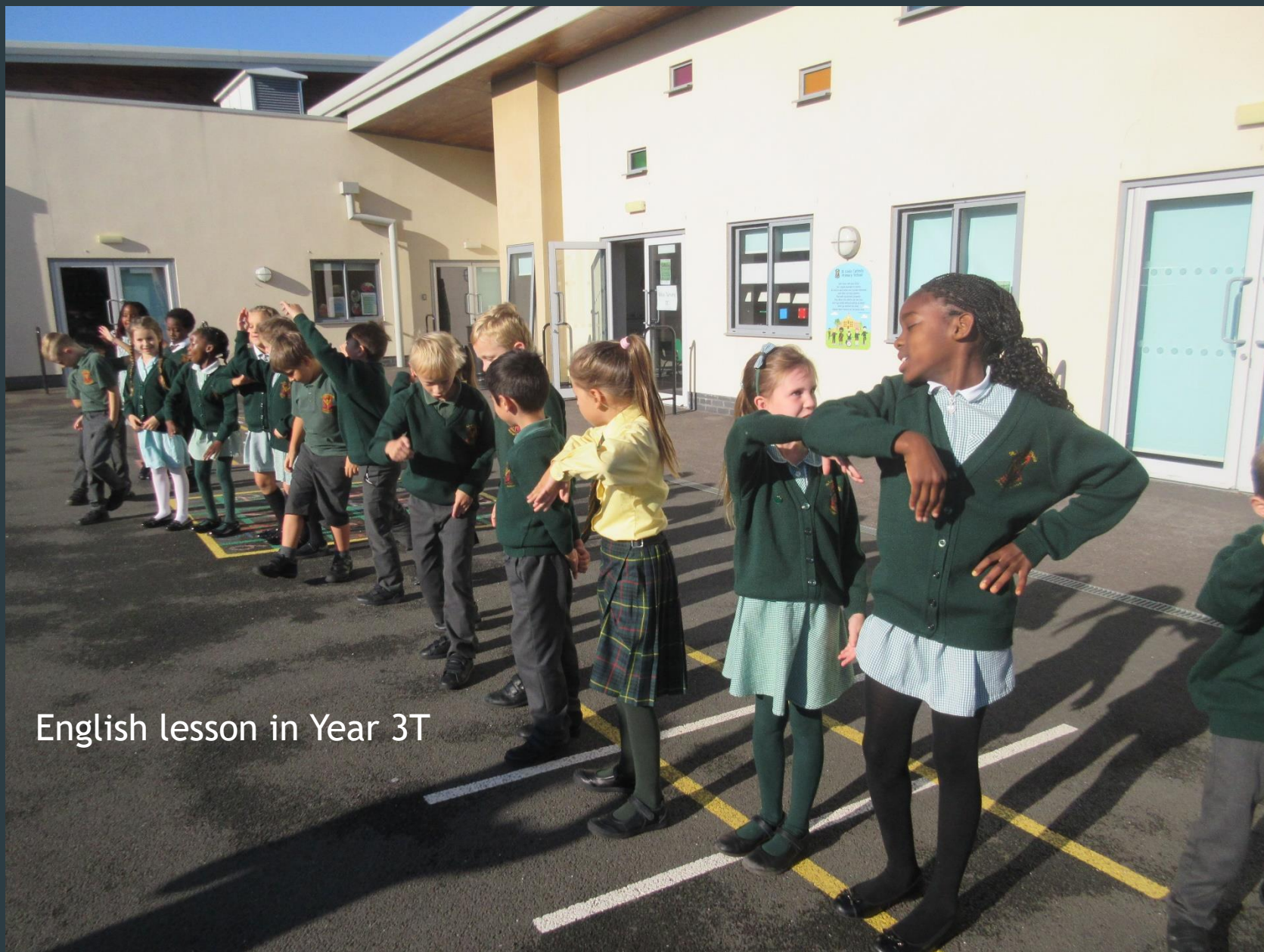
English lesson in Year 3T