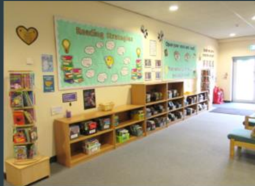
How our school looks now