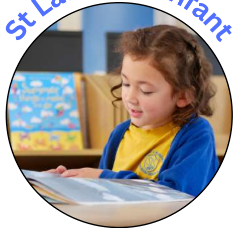
St Laurence Infant