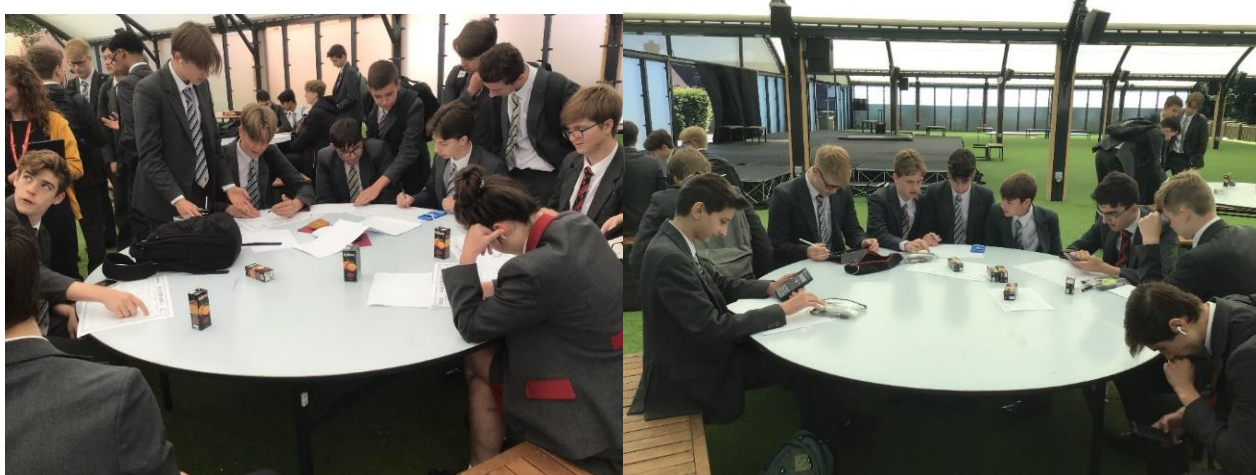
GCSE Exam Breakfast Revision

Students in Years 7-8 follow the National Curriculum using the Pearson Edexcel scheme. As we are a selective school, we look to stretch and challenge our students. We begin in Year 7 with a scheme of work that is based on the Year 8 materials. This takes place after the first half term where we dedicate this time to bridging any gaps students may have from their previous setting. We understand that every student comes with a unique learning experience and are dedicated to meeting pupils' individual needs in order to access our challenging curriculum.