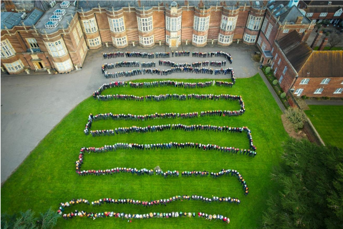
Students celebrating Pi Day 2025

Mathematics is the means of looking at the patterns that make up our world and the intricate and beautiful ways in which they are constructed and realised. Numeracy is the means of making that knowledge useful.