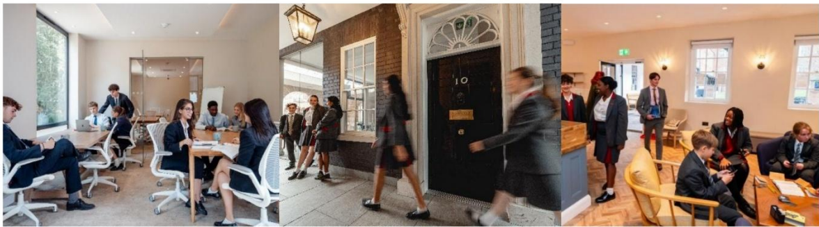
International Business & Languages Centre (IBLC)

In addition to the former Tudor Palace of Beaulieu, 2025 marked the acquisition of New Hall's second Grade I listed building, Boreham House. Plans include our Preparatory Divisions moving to Boreham House, one mile from the New Hall campus.