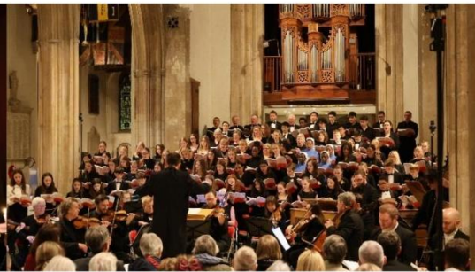
Beaulieu Park Singers | Community Choir