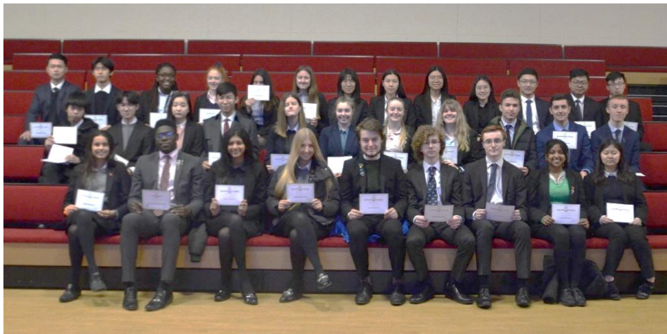
Senior UKMT Bronze, Silver and Gold winners

The Department also consistently achieves excellent examination results at GCSE and A Level. In 2025, a third of our students achieved 8+ (A*) in GCSE Mathematics, with a half at 7+ (A*/A). In our first ever cohort of GCSE Further Mathematics, an incredible 82% achieved 8+ (A*) with 93% at 7+ (A*/A). At A Level, Mathematics is often the most popular subject at New Hall, and around half of our Mathematics students achieve A*/A grades.