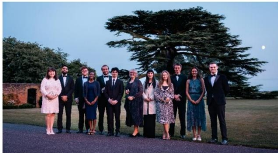
Annual Oxbridge Dinner