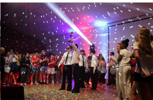
New Hall Come Dancing Charity Competition