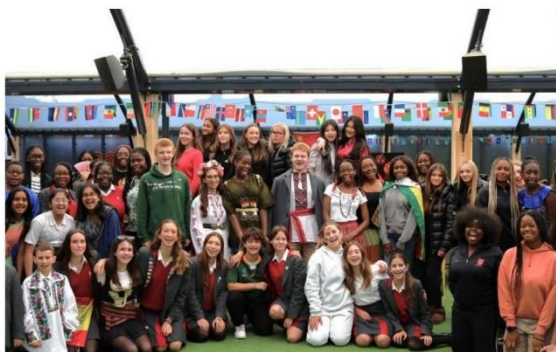
Annual Culture Day