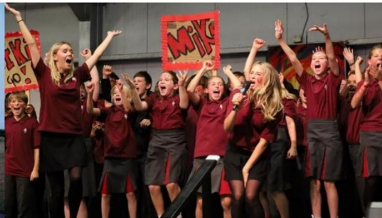
Foundation Day Singing Competition