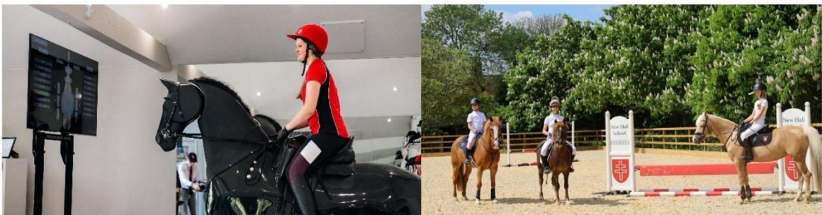
Two Racewood Equestrian Simulators