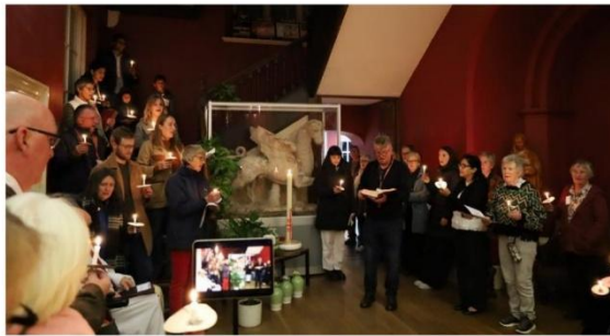
Easter at New Hall