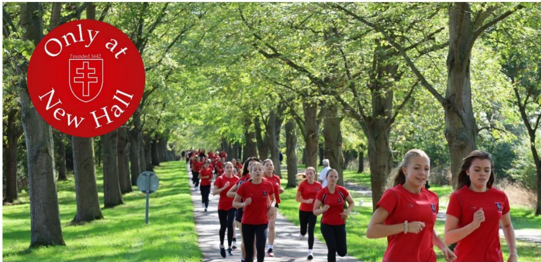
Annual Avenue Run down our historic tree-lined drive, part of our Grade II listed Park and Gardens