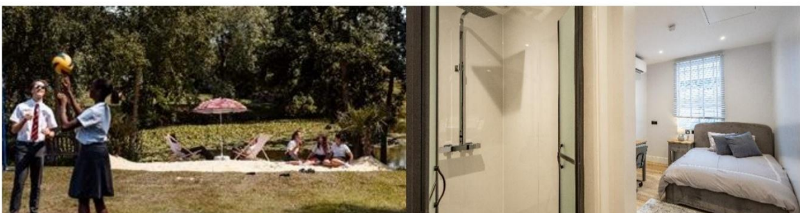
New Hall Beach