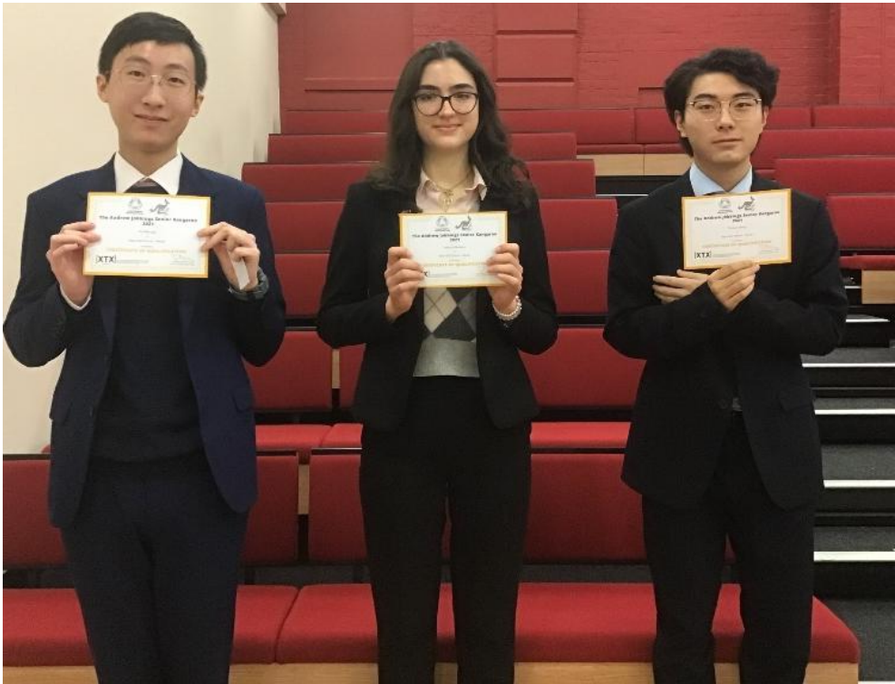
UKMT Kangaroo Qualifiers

Beyond the formal examinations, the Department has a strong track record in the UKMT challenges, entering our top students for the Junior, Intermediate and Senior Challenges each year, as well as competing in the Team Challenge at Intermediate and Senior Level. Our most recent outstanding achievement was one of our A-Level Further Mathematics pupils qualifying for the British Maths Olympiad in the 2024-2025. The Mathematics Department enjoy working together to support pupils in their mathematical journey whether it is for additional academic qualifications or just love for the subject.