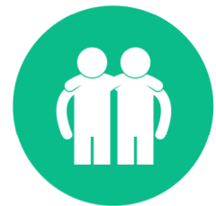
Occupational health support