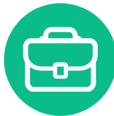
Employee assistance programme