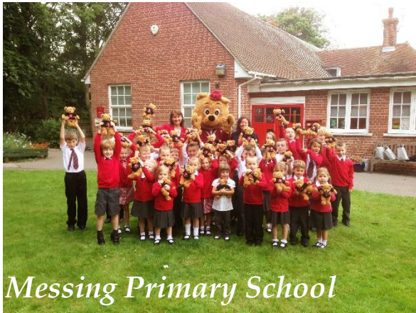
Messing Primary School

In 2012, the School established the New Hall Multi Academy Trust (NHMAT) and became sponsor of nearby Messing Primary School – an Ofsted-rated ‘Good’ school. It is now looking ahead to new ventures and exciting opportunities to further grow its partnership work.