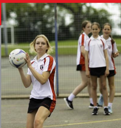
Annual Celebration of Sport Award