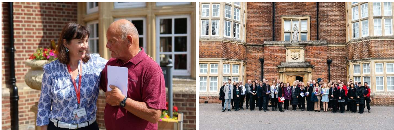
Staff celebrating working at New Hall for over 10 years in 2024

Staff are supported and encouraged in their career development, including through generous funding for courses, and flexible working/sabbaticals for study and training. In 2024-25, 30% of staff progressed, internally or externally, into new roles, promotional opportunities, or additional responsibilities. Since 2020, New Hall has trained 11 staff as teachers, through the school-based PCGE and ECT courses. The School welcomes apprentices and graduate entry applicants for a range of roles, to have a diverse workforce, combining experienced staff and new talent.