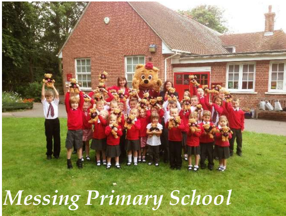
Messing Primary School

In 2012, the School established the New Hall Multi Academy Trust (NHMAT) and became sponsor of nearby Messing Primary School – an Ofsted-rated ‘Good’ school. It is now looking ahead to new ventures and exciting opportunities to further grow its partnership work.