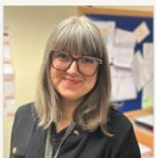
Teacher of Religious Studies and Junior Housemistress Joined in 2016

“I feel valued at Bancroft's, and I appreciate that there does not seem to be a strong sense of hierarchy, rather the pursuit of shared goals across the staff and student body.”