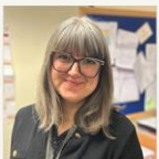
Teacher of Religious Studies and Junior Housemistress Joined in 2016

"I feel valued at Bancroft's, and I appreciate that there does not seem to be a strong sense of hierarchy, rather the pursuit of shared goals across the staff and student body."